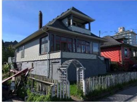
39 Lewis Street, built 1908.