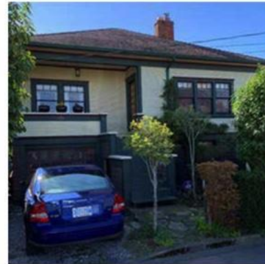
53 Lewis Street, built 1929.