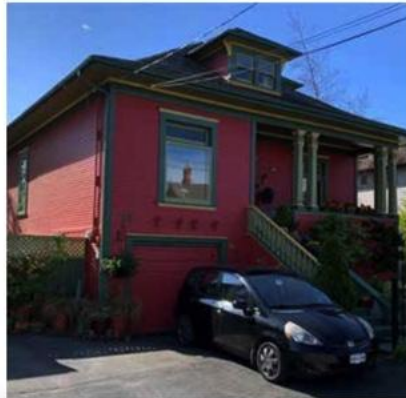
35 Lewis Street, built 1907.