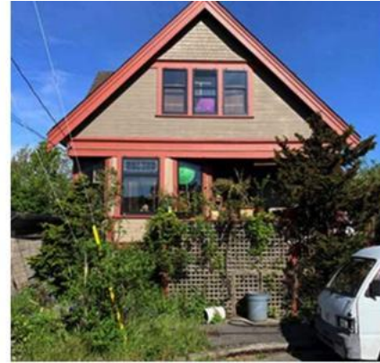
50 Lewis Street, built 1912.