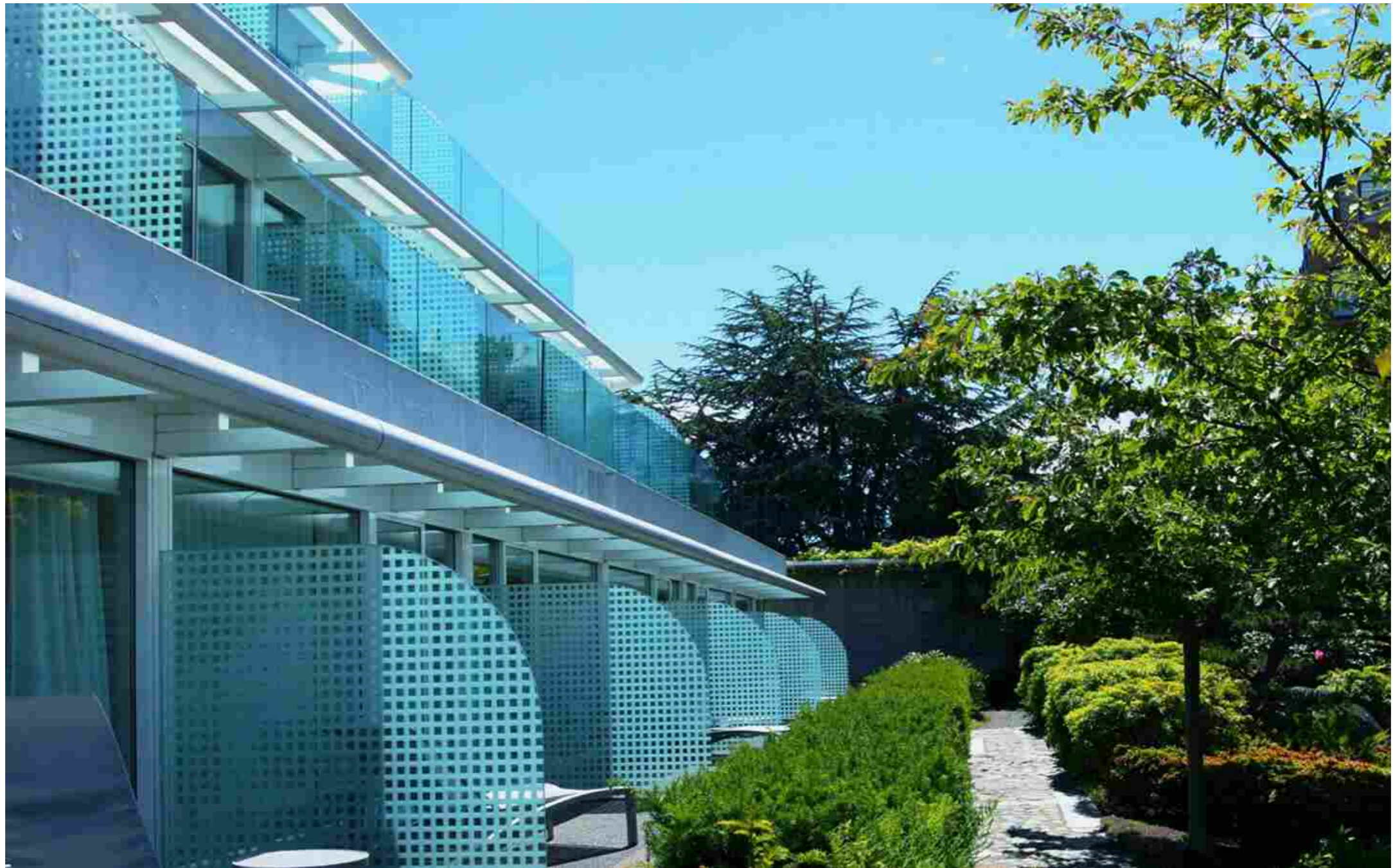
Existing Erickson Wing with angled step back