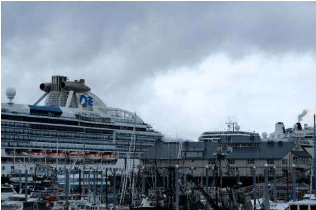
PCL Coral Princess, HAL Volendam, and the NCL Norwegian Bliss docked in Ketchikan 6/4/2018

This report is prepared annually by the Alaska Department of Environmental Conservation (ADEC, or the Department) Division of Water Commercial Passenger Vessel Environmental Compliance Program (CPVEC or the Program). The intent of this report is to provide information on the Program’s monitoring and compliance efforts with cruise ship air pollution.