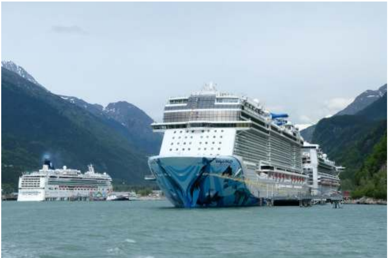
NCL Norwegian Pearl, NCL Norwegian Bliss, and the PCL Star Princess docked in Skagway 6/13/2018